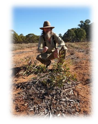
Figure 3 Mick Lowe with seedling