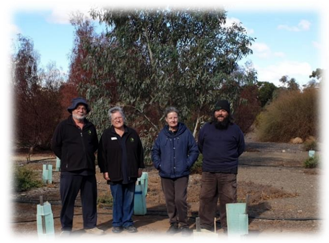
Figure 2 Volunteers after planting in Bushgardens