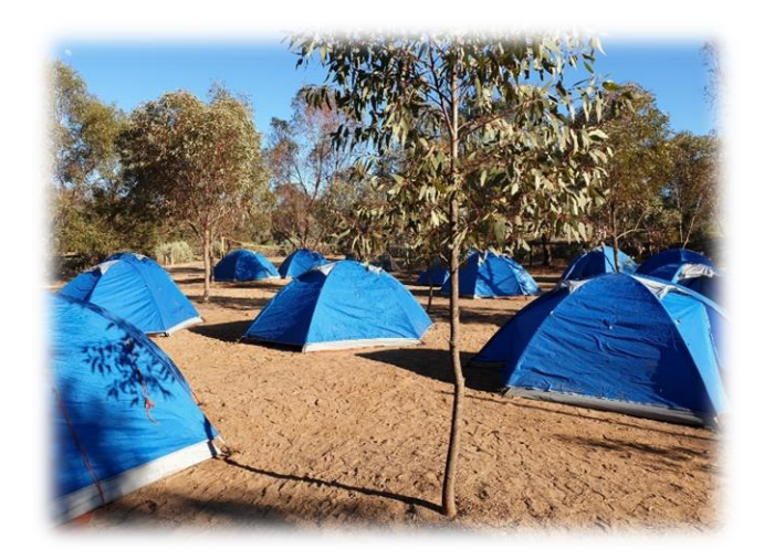
Figure 1 school camp at Meldanda