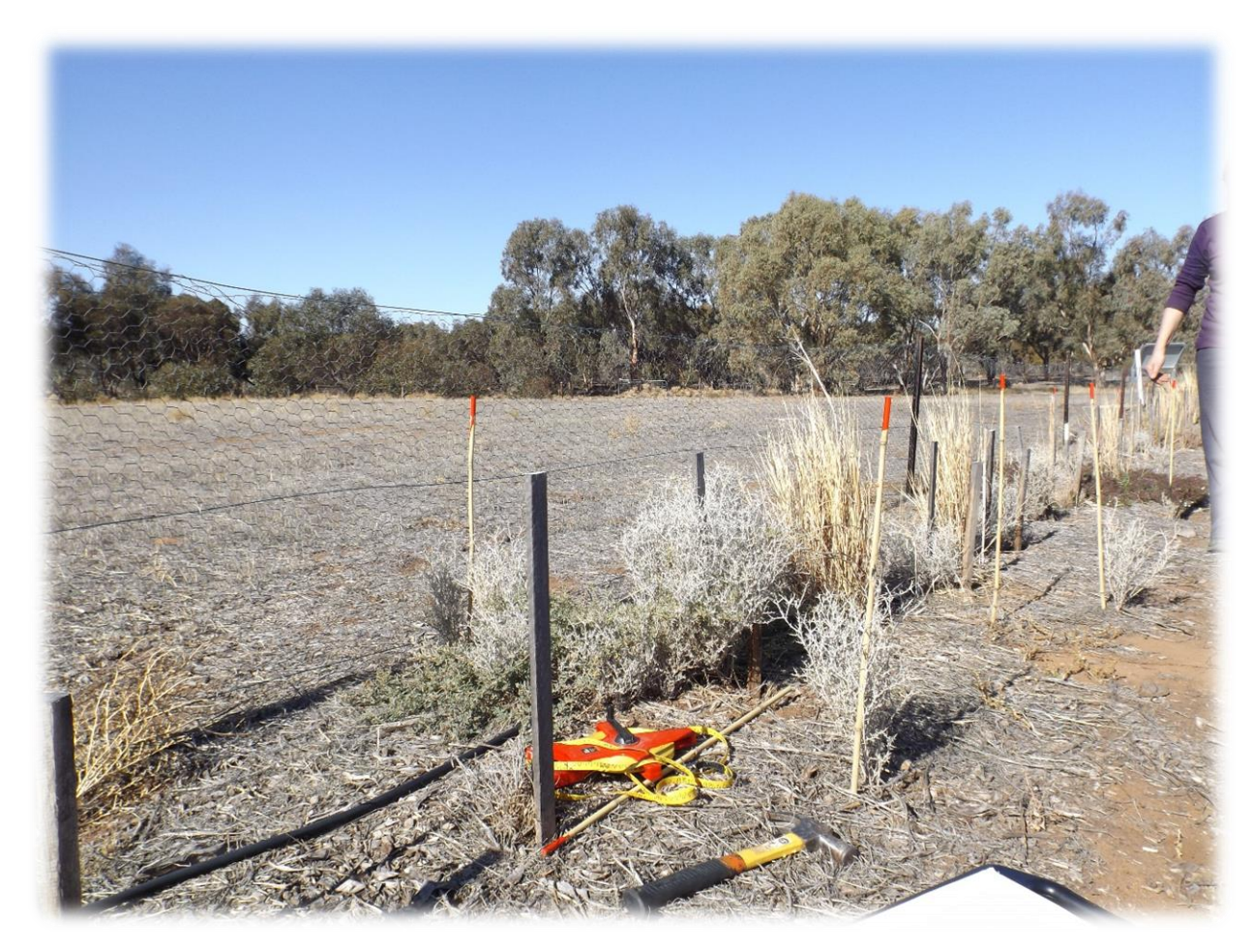
Figure 7 annual monitoring of spiny daisy site