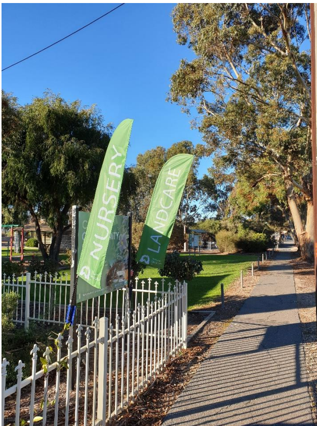
Figure 3 new signs for nursery