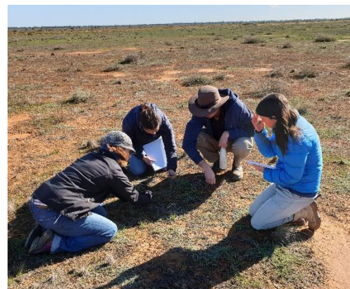
Figure 9 grassland ecologists