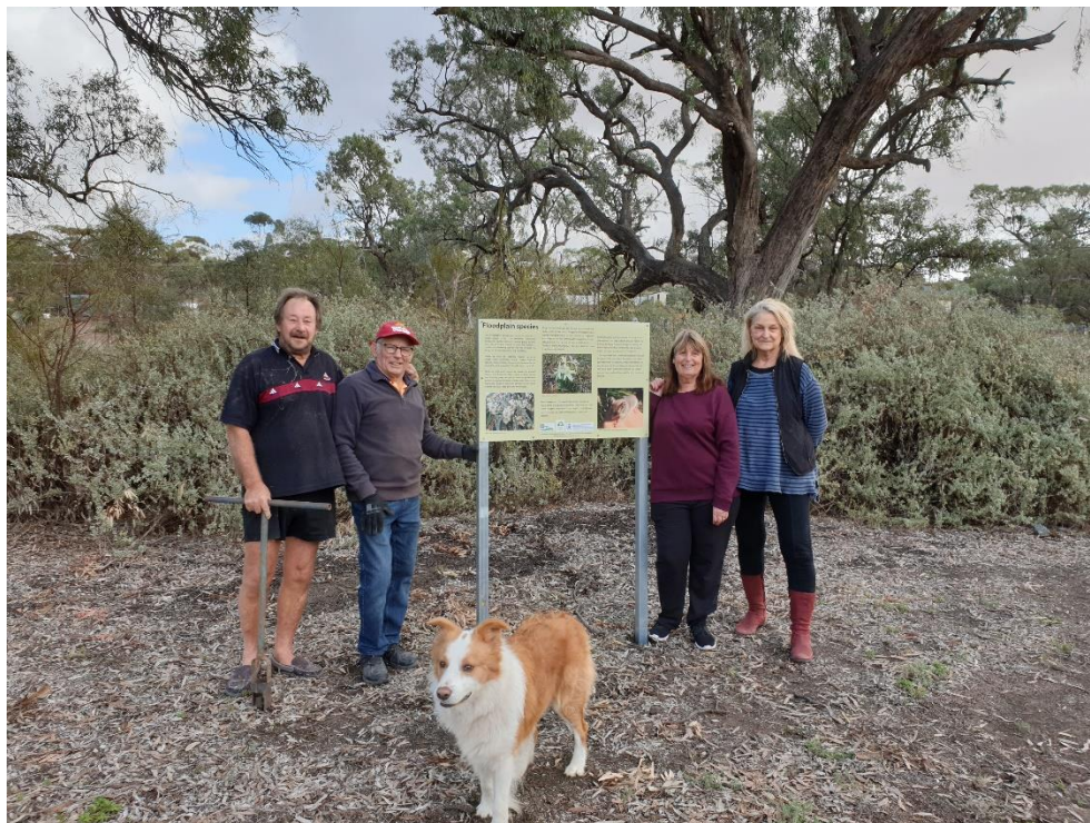
Figure 10 Blanchetown volunteers with new sign