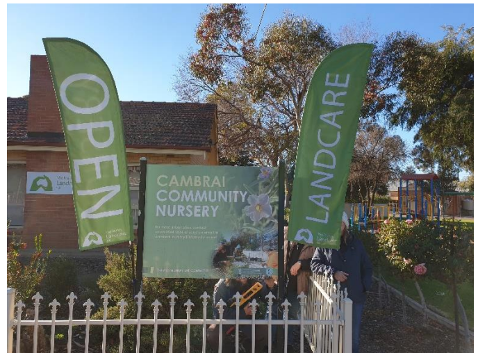
Figure 4 new signs for Landcare office