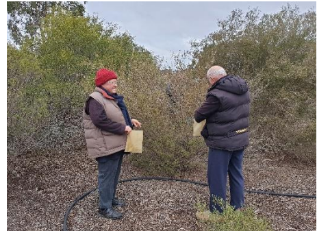
Figures 3, 4, 5 seed collection events at Meldanda with volunteers, collected Melaleuca, Leptospermum, Hakea and Atriplex.