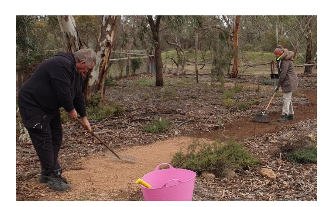
Figures 1 and 2 Bushtucker Garden Revamp.