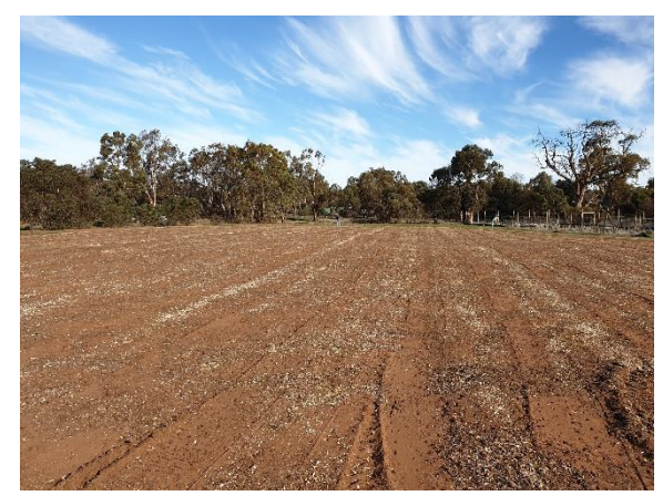
Figure 6 trial site sown at Meldanda