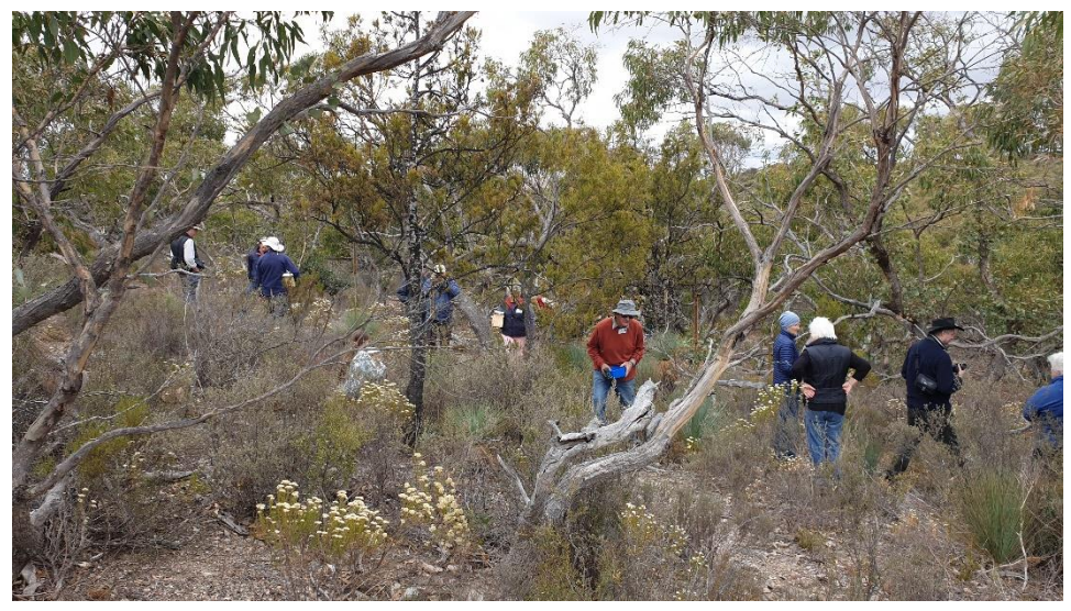
Figure 7 Waterhouse Club in the Tothills installing WPP boxes.