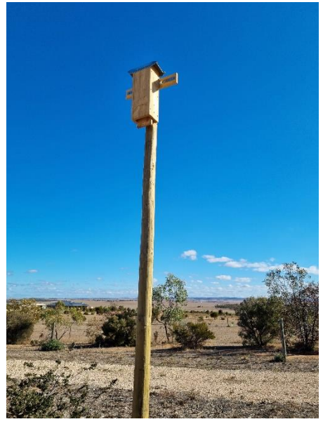
Figure 4 bat box installed at Mannum.

34. Clive Kiernan from Mannum installed the bat box we gave him, he sent us a photo of it, he put it up high on a pole.