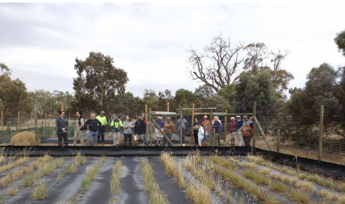
Figure 1 Native Grass ID workshop.