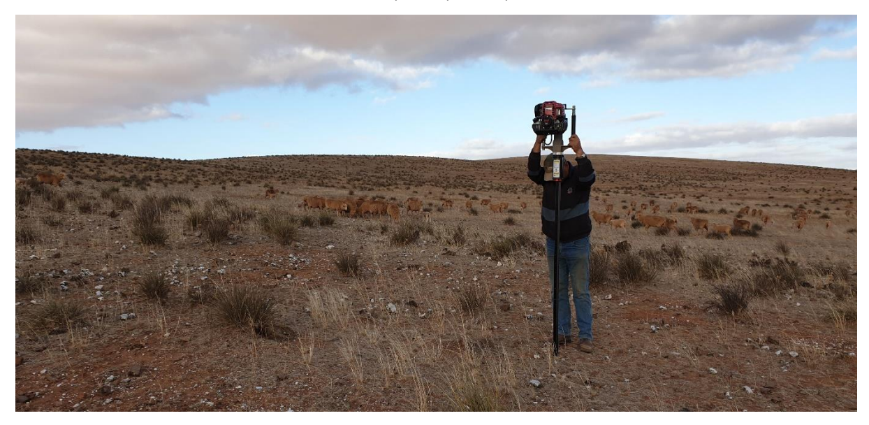
Figure 3 Brian Sleep installing dropper into rocky ground for a photo point at trial site, Terowie.