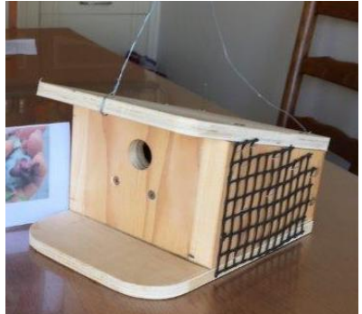
Figure 4 nest box designs provided by Ann Williams