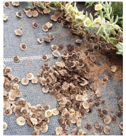
Figure 1 Ptilotus spathulatus starting to set seed.