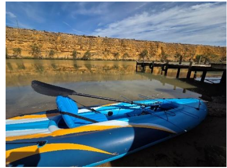
Photo 6 The inflatable canoe for monitoring, all good on a calm day.