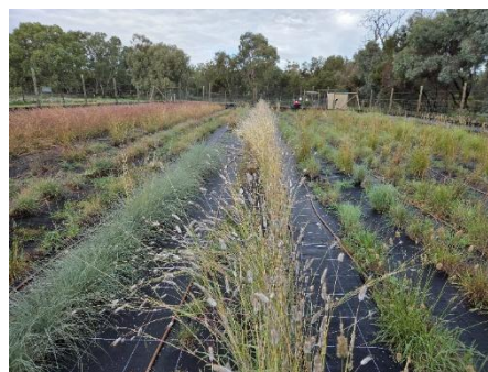
Photo 9 Native grasses looking great.