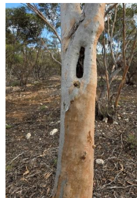
Photo 7 MDC python tree hollow.