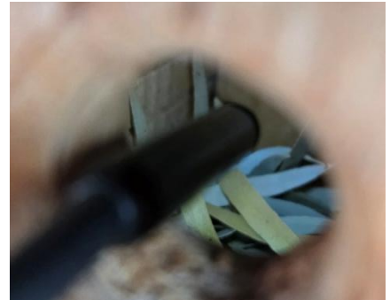
Photo 5 WPP box pile up with leaves.