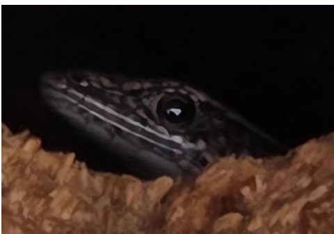
Photo 3 Ragged snake-eyed skink in possum box, zoomed in photo.