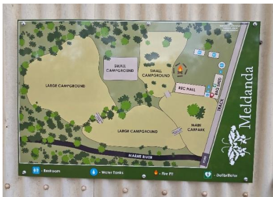
Photo 1 new campground layout map sign